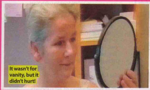
It wasn't for vanity, but it didn't hurt!