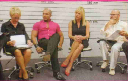
The applicants line-up for their chance to undergo an extreme makeover.